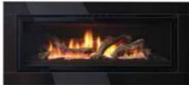
Glass fascia in black with black inner door frame