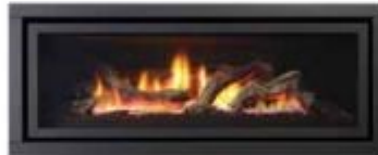
Door frame and fascia in black