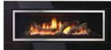
Glass fascia in black with brushed stainless steel inner door frame