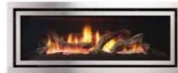
Door frame and fascia in brushed stainless steel