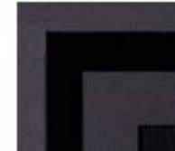
Clean Front with 22mm Finishing Trim