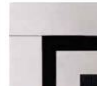
Brushed Stainless Steel Fascia